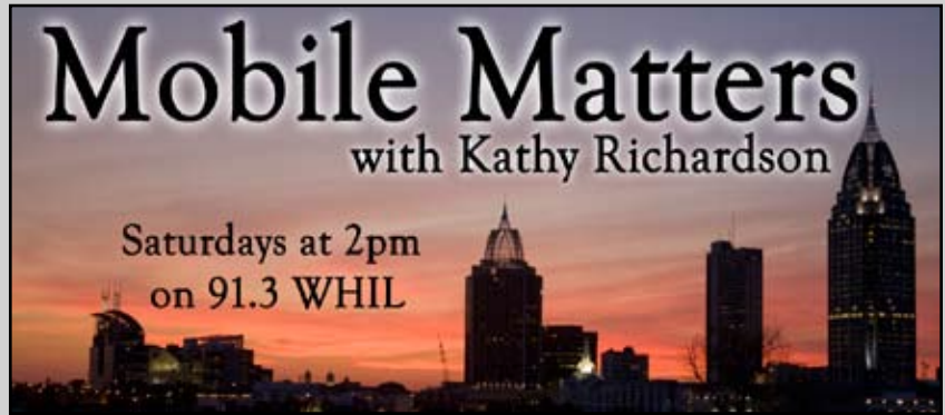
Sunset over Mobile

Current and former residents of Bayou La Batre respond to the nomination of local physician, Dr. Regina Benjamin, nominated as the next Surgeon General of the United States.